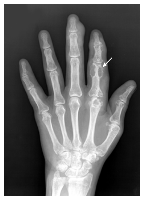
Figure 1. Plain radiograph showing severe tophaceous gout with erosions ( arrow ) around the proximal phalanx.

commonly the first metatarsophalangeal (i.e., podagra), midtarsal, ankle, or knee joints. Pain, erythema, and swelling often begin in the early morning and increase and peak within 24 to 48 hours. The pain is severe, and patients often cannot wear socks or touch bedsheets during flare-ups. Even without treatment, the attacks typically subside within five to seven days.