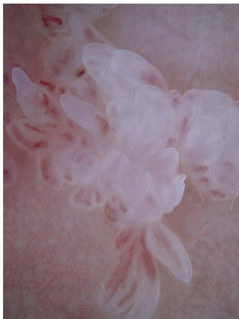
Fig 3. Dermoscopic findings of condyloma acuminata on vestibule of a 6-month-old girl show multiple irregular projections with tapering ends arising from a common base. The projections, whiter and broader than vestibular papillae, have conglomerate vascular structures.

dermoscopic appearance of condyloma acuminata. In our experience, dermoscopy of condyloma acuminata shows multiple, irregular projections with tapering ends arising from a common base. The projections have conglomerate vascular structures and are more white and broader than vestibular papillae; this might correlate with the hyperkeratotic and acanthotic features of condyloma acuminata (Fig 3). Therefore, along with the five clinical parameters suggested by Moyal-Barranco et al, 3 we believe that characteristic dermoscopic findings provide additional diagnostic clues to differentiate vestibular papillae from condyloma acuminata.