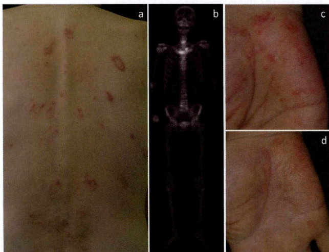
Fig. 1. (a) Scaly erythemas with tiny pustules were scattered on the back (Case 1). (b) Bone scintigraphy showing increased uptake in the right sternoclavicular joint and bilateral knees, and also sinusitis. Palmar lesions (c) before, and (d) after antibiotic therapy.

None of the patients had a previous history of tonsillitis. Arthralgia was recognized in 3 patients, and 2 of them further developed extra-palmoplantar lesions. Dental treatment, with administration of antibiotics, led to improvement in the cutaneous lesions in all cases. In addition, dental treatment resulted in relief of pain in